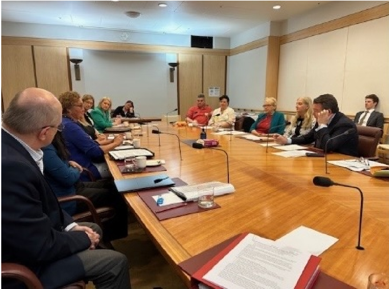
Grandparent and kinship carers from across Australia meeting with the Parliamentary Friends of Grandparent and Kinship Carers, October 2023.