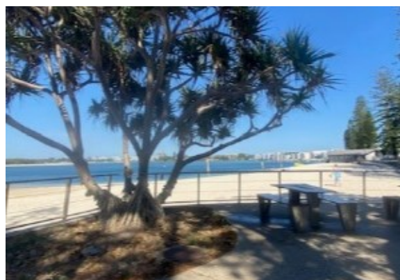
Doing it tough on the Sunshine Coast.