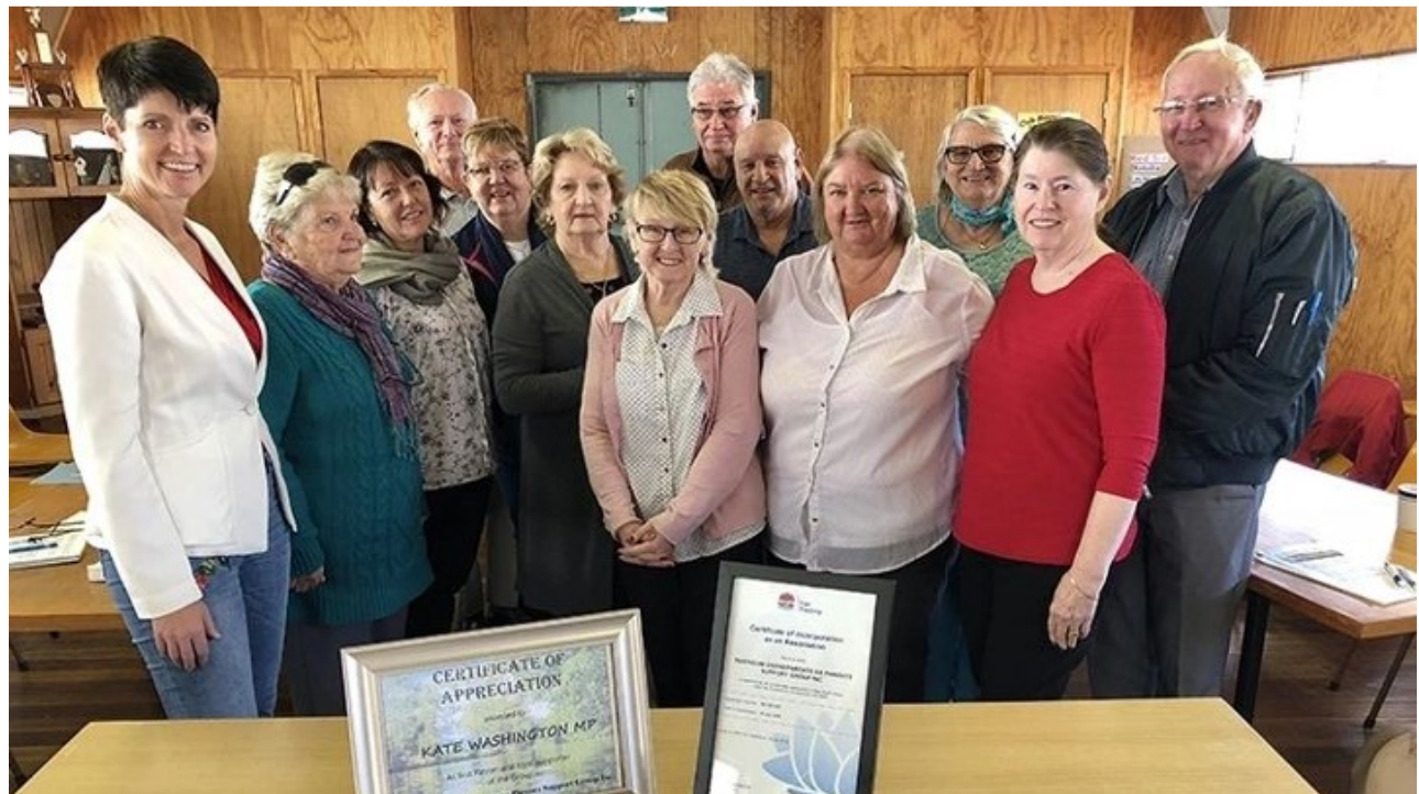
Rlvergum Support Group, Raymond Terrace NSW.