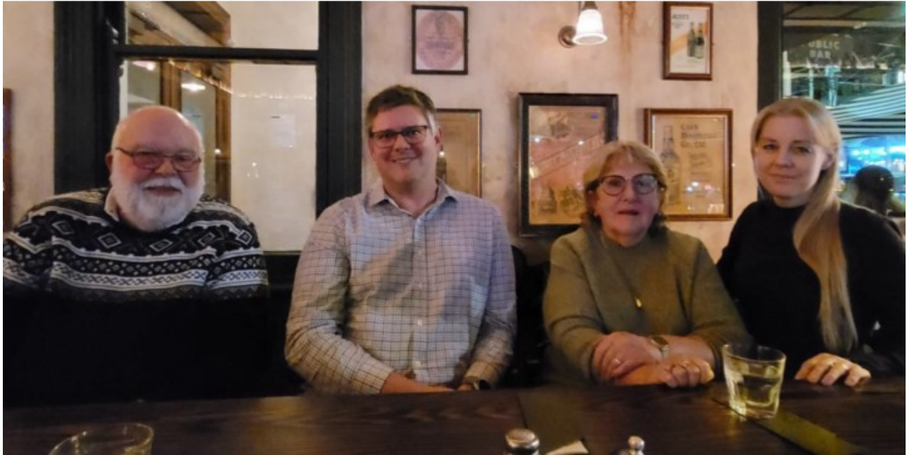
Kin Raising Kids Tasmania representatives.