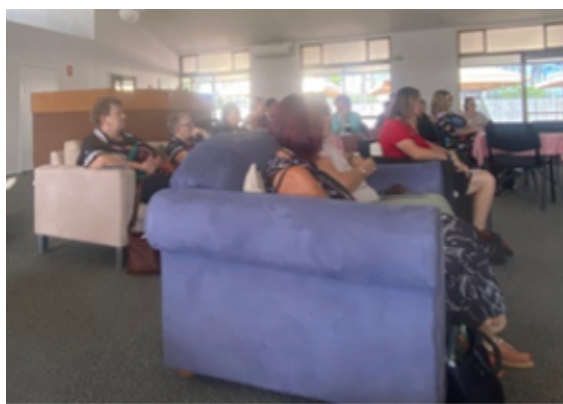
Family Law Pathways Forum, Bundaberg.